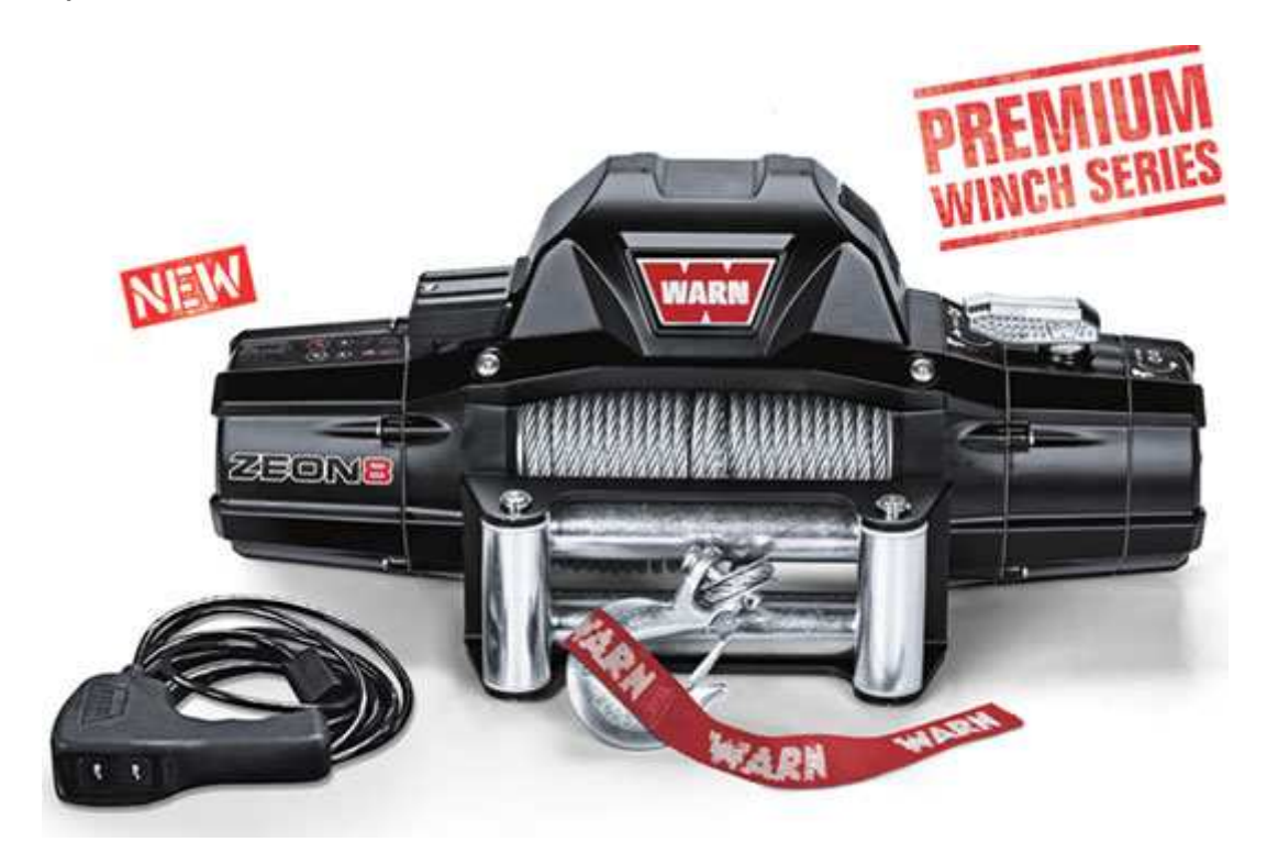
WARN<sup>®</sup> ZEON<sup>™</sup> 8 Advanced, capable, and strong

Don't let the good looks fool you. We've packed the ZEON 8 winch with all the performance features off-roaders said they needed most. From a heat-dissipating brake down to an incredibly smooth planetary gear train, this winch is ready to hit the trail. The 8,000 lb. pulling capacity, combined with a fast line speed make this winch the perfect choice for Jeep and SUV trail rigs.